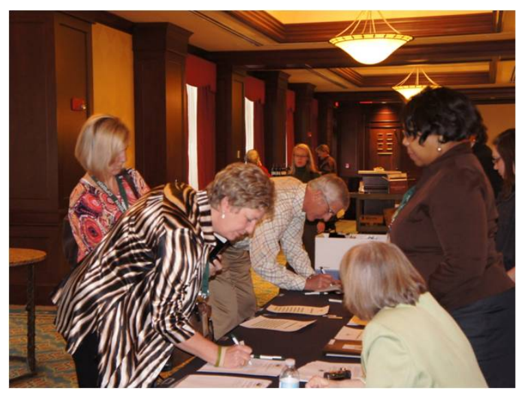
Practitioner-investigators checking in for the meeting.