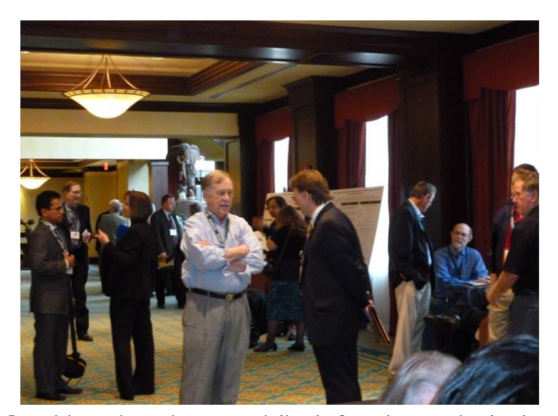
Practitioner-investigators socialize before the meeting begins.