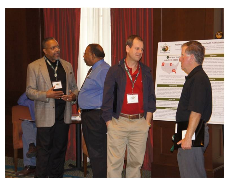
Practitioner-investigators discuss the meeting during the break.