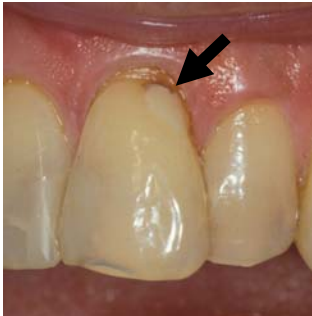
Reprinted from Mjör 2005 with permission

For Questions 22-24: The patient is a 30-year old female with no relevant medical history. She has no complaints and is in your office today for a routine visit. She has been attending your practice on a regular basis for the past 6 years. (Circle your answers above)