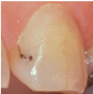
Reprinted from Mjör 2005 with permission

22. The patient has 5 existing restorations and is not missing any teeth. Indicate what treatment you would provide to the restoration shown by the arrow in the first picture on the left.